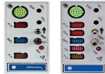
( 9X496-B) (9X496-C) Command Modules

For use with Spacelabs Command Modules (90496 & 91496) configured with the invasive pressure option. Option B supports two pressures; Option C supports four pressures.