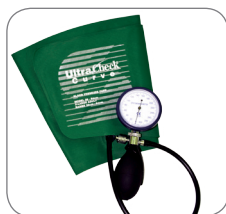
UltraCheck Curve with Gauge