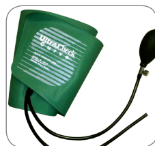
UltraCheck Curve for SPHYG