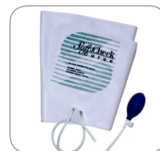
SoftCheck Curve for SPHYG